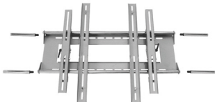
Wall Plate, Mounting Rails with Tilt Mechanism, Rod Extensions, Mounting Rail Extensions